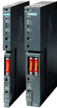
SIMATIC S7-400, power supply PS405: 20 A, wide range, 24/48/60 V DC, 5 V DC/20 A,